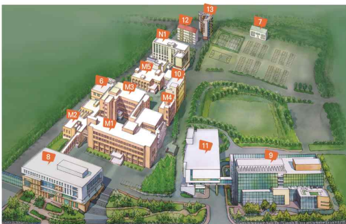
보문캠퍼스 | 35015) 대전광역시 중구 문화로 266